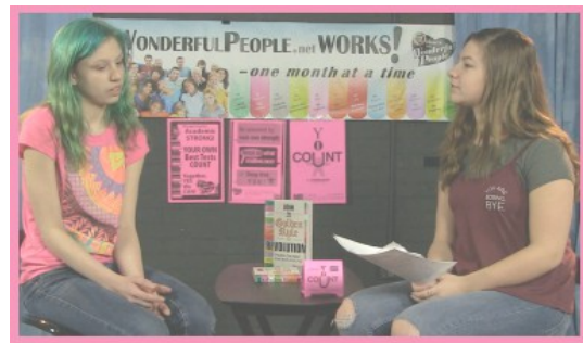
Community Project: Kids Talk